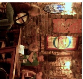
(2) An spailpin fanach