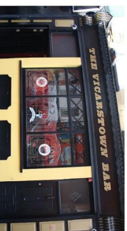
(5) The Vicarstown Bar