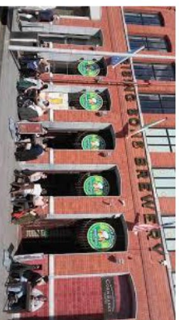
(4) Rising sons brewery