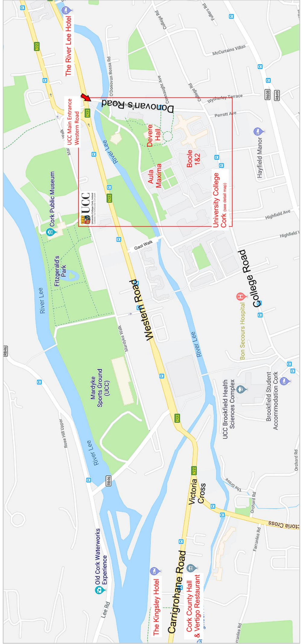
Map showing UCC in relation Cork County Hall and Kingsley and River Lee Hotels and refer to detail map for UCC locations