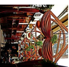
(8) Crane lane