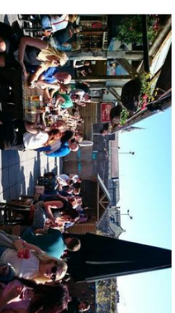
(6) Deep South