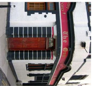
(1) The oval