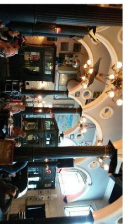
(3) The Bodega