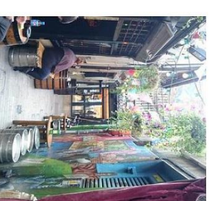
(7) Mutton lane inn