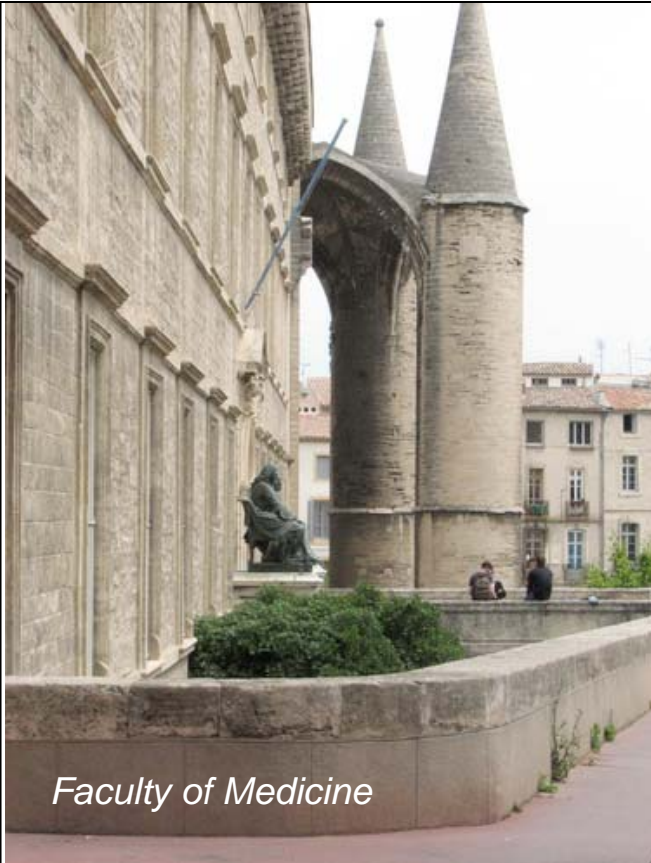
Faculty of Medicine

Montpellier France, Faculty of Medicine, July 10-12, 2012 Registration and Abstract submission are open January 1 st , 2012 Deadline May 15 th , 2012