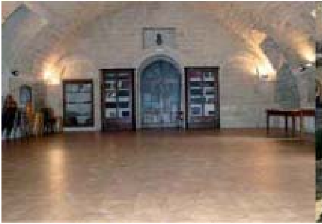
Room where posters will be held