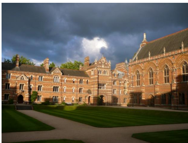
Keble College, Oxford